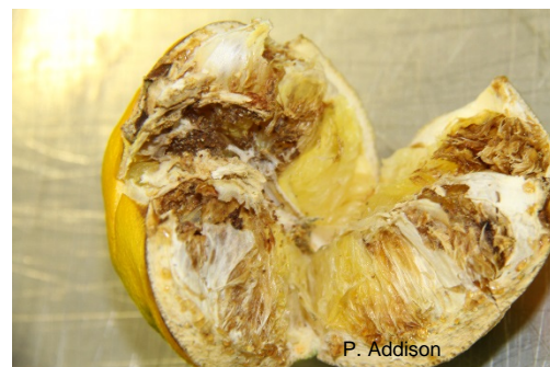
Carob moth, Ectomyelois ceratoniae , feeding damage.

* Indicates known hosts in South Africa.