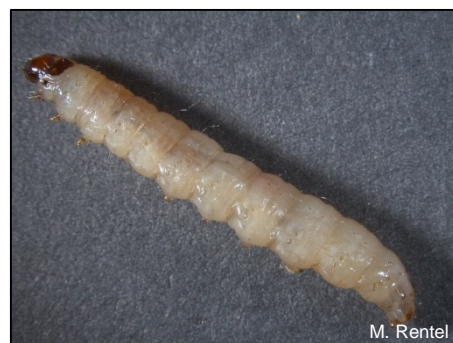
Carob moth, Ectomyelois ceratoniae larva.

Larvae are slender, elongate, cream white to light pink in colour. Their head capsules are yellow to brown and superficially they look similar to FCM larvae.