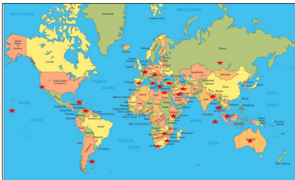
Carob moth, Ectomyelois ceratoniae , distribution. Red stars indicate published presence records of pest. Base map from http://geology.com/world/world-map.shtml . Reprinted from Morland (2015).

Carob moth is thought to originate from the Mediterranean region but is found all over the world. In South Africa it was first discovered in the Western Cape in 1974 but has since been found throughout South Africa.