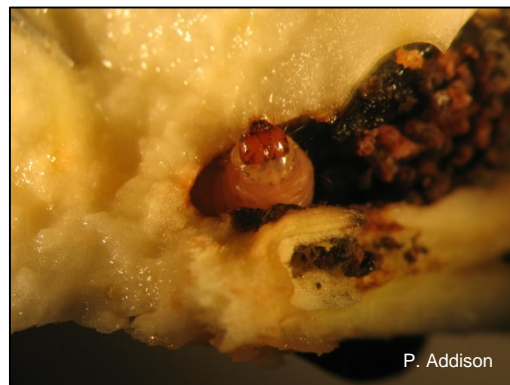
Carob moth, Ectomyelois ceratoniae , feeding damage.

In South Africa, over 50 hosts have been identified, many of which are exotic species. Carob moth is a minor pest on citrus, especially grapefruit, as well as on pomegranates, pecan and macadamia nuts.