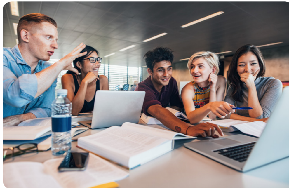
**Figure 2: Students working in groups

The students were engaged in various types of learning (Laurillard, 2012) while completing this learning activity. Firstly, they were prompted to investigate their case study documents and search for further information on them (inquiry). Secondly, they consolidated what they had learned by articulating their current conceptual understanding and how this is used in practice by building a video presentation (production). Thirdly, they also, at the same time, learned from each other while working in groups (collaboration). This was all done by using real-world case studies and the students were therefore engaged in authentic learning (Lombardi, 2007).