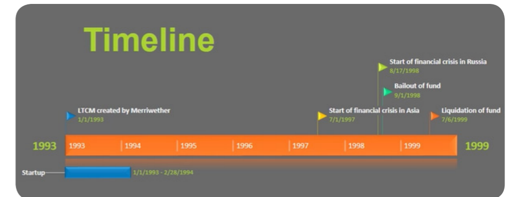
Figure 3: Example of a video presentation

Throughout the semester, the videos were played during the contact sessions, after which they were discussed. The students could ask the presenters of the videos questions and a discussion often ensued. This ensured that all the students could learn from all the case studies.